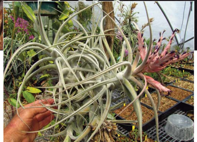
Figure 4. This Tillandsia ehlersiana was mounted on a stick three years before being photographed. A bigger branch would have made a better ornament.