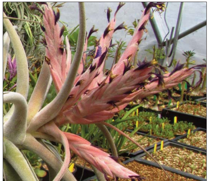
Figure 2. Inflorescence of Tillandsia ehlersiana . The actual flowers are the violet tubes; the pink bracts attract hummingbirds. 3