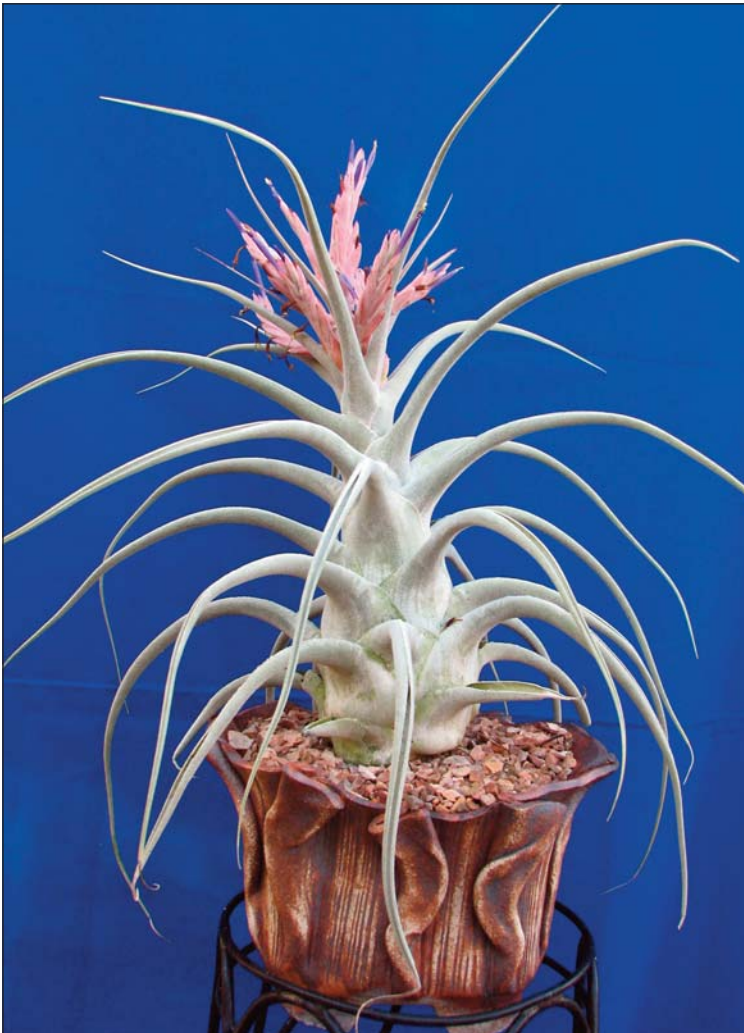
Figure 1. A mature single rosette of Tillandsia ehlersiana . It’s in a 2-inch pot, set into a 12-inch pot.

To grow this plant outdoors in the desert, give it very bright light to keep the foliage white. Full summer sun is too much, but it will do very well under the edge of a mesquite or palo verde tree. Soak both leaves and roots three times a week during the summer, and once a week or so during cool weather. Protect it from frost.