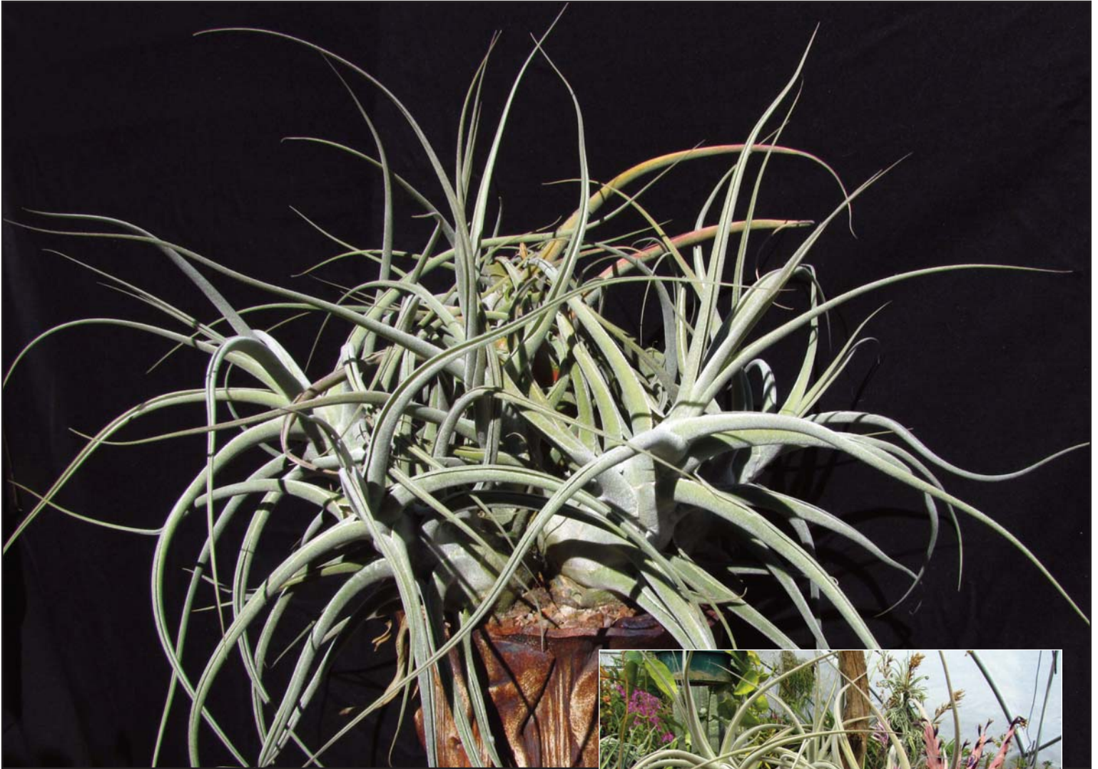
Figure 3. A colony of five Tillandsia ehlersiana rosettes. This is the same plant as in Figure 1, two years older. The original rosette is dying and barely visible amidst its offsets.

Tillandsia ehlersiana is rarely found in succulent nurseries. Look for it in bromeliad nurseries.