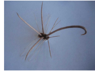
Barrel Cactus Spines

A Succulent is a plant that has a way to store water so it can keep growing without getting any rain for a long period of time, sometimes over a year or more.