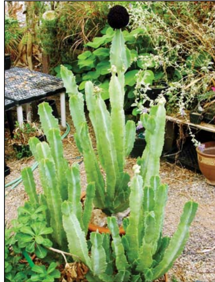
Figure 1. These three Caralluma russelliana plants are just two years old, and one is beginning to flower.

Considering how ornamental this species is, there is very little information about it on the web except for numerous articles about its chemistry. The stems contain pregnane glycosides that are being investigated for possible medicinal properties.