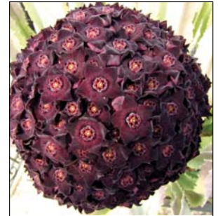
Figure 2, 3. The capitate inflorescence of Caralluma russelliana bears over 100 small flowers. They last about a week. Plants bloom several months a year.