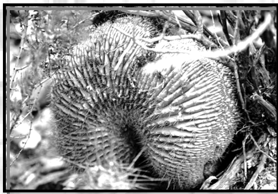
Rare Echinopsis leucotricha crest, San Juan, Argentina.

November in Argentina corresponds to May in Arizona, so many of these photos are of cactus in bloom. The purpose of the expedition was to gather data for the development of a Cuyo exhibit at the Arboretum, which is scheduled to open later this year.